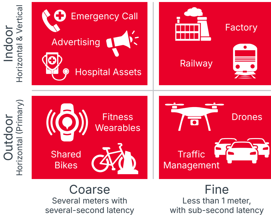
Figure 1. 3GPP is developing accuracy, latency, and availability requirements across different use cases to help guide 5G wireless development. 2 While many use cases and requirements are under consideration, it can be useful to think of location requirements within a few rough buckets.