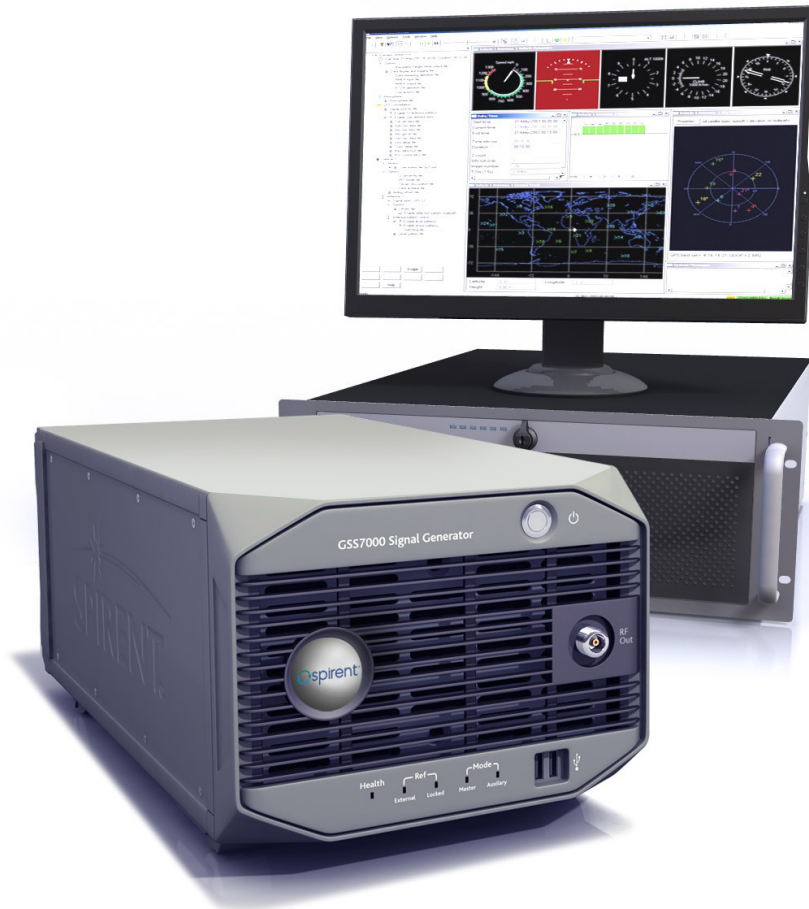
Figure 3. Hardware and software of a GSS7000 system