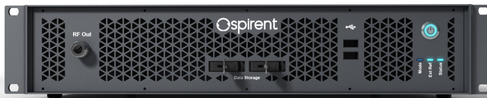
Figure 1. PNT Xe simulation system

With its rack-mountable, lab- and field-ready form factor, PNT Xe is engineered for flexible deployment — supporting everything from fundamental system verification to more scalable operational testing.