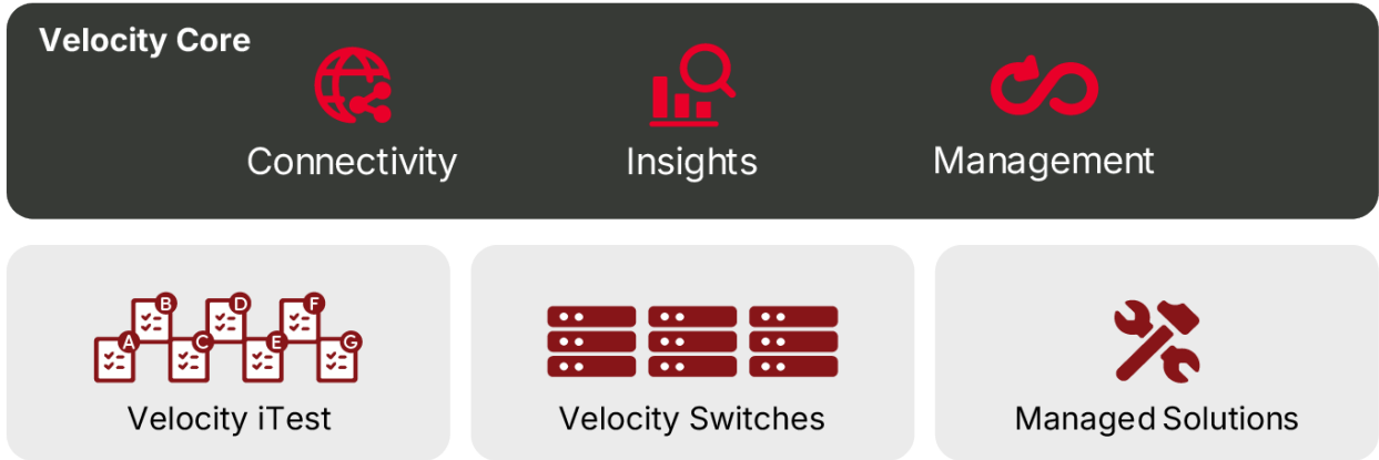
Figure 2. Velocity Automation Portfolio

The Velocity Automation Portfolio supports the complete automation of customer lab and testing environments for large enterprise, NEM, and service provider organizations. It is the only fully integrated solution to provide automation and management of lab resources, facilitate automated test suite creation, oversee lab connectivity and topology, and provide professional services for initiative success.